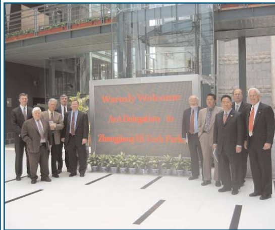
AeA's Fourth Annual Chairman's Delegation to China visits Zhangjiang Hi-Tech Park (above) for meetings with Chinese business leaders. Additional meetings were held with Chinese government officials, the U.S. embassy and fellow technology companies.

For more info visit: www.aeanet.org/china2005