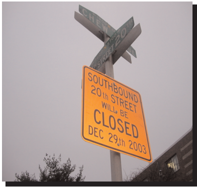
20th Street Becomes One Way

Construction of south campus will not be finished until 2005, but the rezoning of 20th Street should be complete by the Fall Semester, therefore depending on how the city resolves the problem there should be a portion of the 111 spots returned by next August.