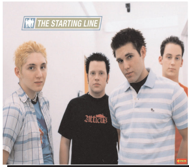
The Starting Line will be the head-lining act of the Spring Fling concert this April 17th in the Union

Listen to the radio? Watch MTV? If so, then you should be familiar with the headlining act of the 2004 Spring Fling Concert. The Starting Line, a four piece pop-punk band from the suburbs of Philadelphia will be coming to La Salle University on April 17th, at 8 PM, to play a free show exclusive to La Salle University students.